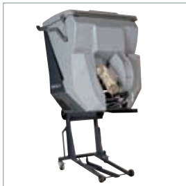
■ Grass collector