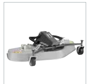
■ Rotary/mulch mower 1500