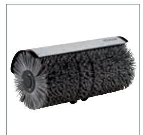
□ Snow sweeper