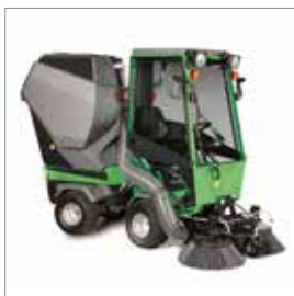
■ Suction sweeper

Change of attachments - no tools required.