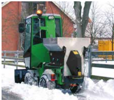
Salt and sand spreader