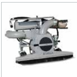
■ Leaf suction unit