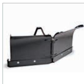
□ Snow V-plough