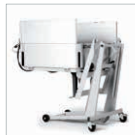
■ Load carrier with tip