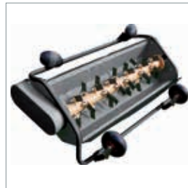
■ Flail mower