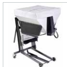
□ Salt and sand spreader

Egholm A/S - 01.05.2021 - Specifications and details are subject to change without prior notice. Illustrations can be shown with extra equipment.