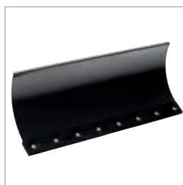
□ Snow plough