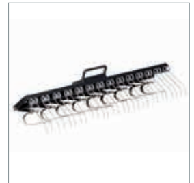
■ Environmental rake