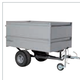
■ Tipper trailer