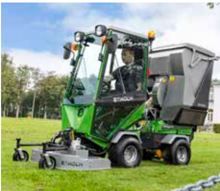
Rotary/mulch mower 1000 with grass collector