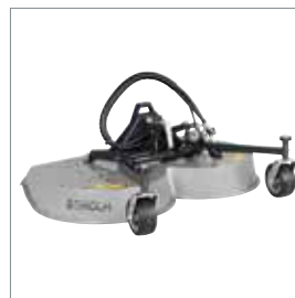
■ Rotary/mulch mower 1200