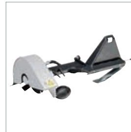
■ Lawn edger