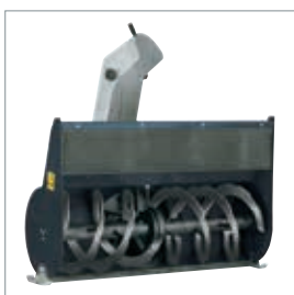
□ Snow blower