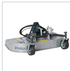
■ Rotary, mulch or collection mower 1000