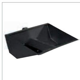
■ Tipping shovel