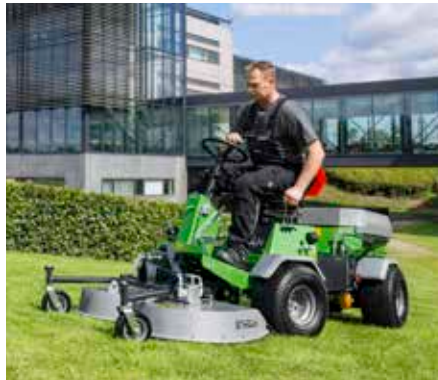
Rotary/mulch mower 1200