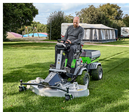
Rotary/mulch mower 1500