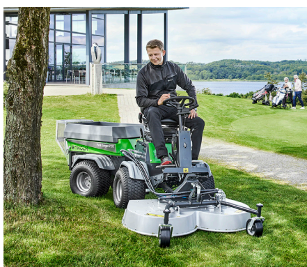
Rotary/mulch mower 1200