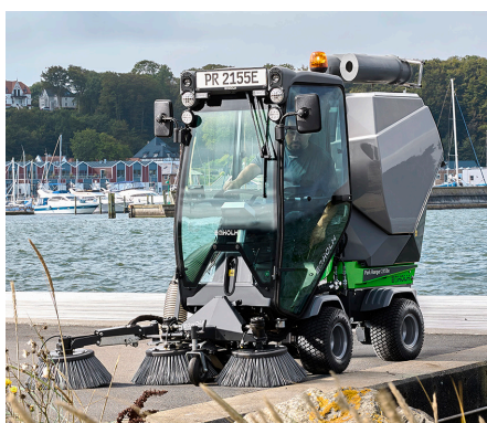
Suction sweeper with 3rd side brush