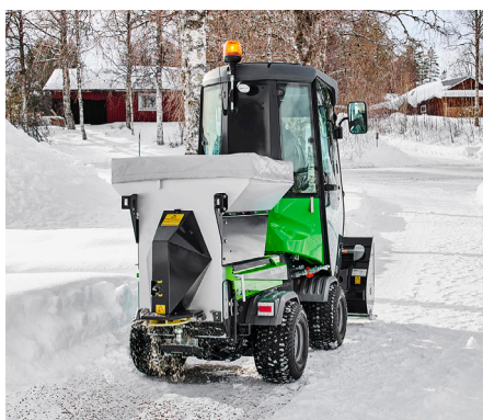
Salt and sand spreader