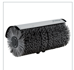
□ Snow sweeper