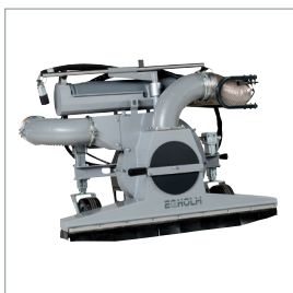
■ Leaf suction unit