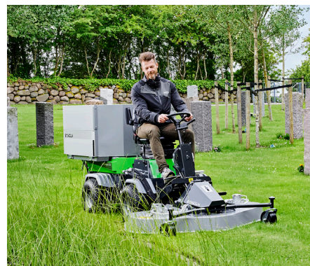
Rotary/mulch mower 1500