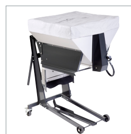
□ Salt and sand spreader

Egholm A/S - 09.08.2024 - Specifications and details are subject to change without prior notice. Illustrations can be shown with extra equipment.