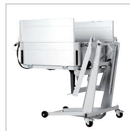
■ Load carrier with tip