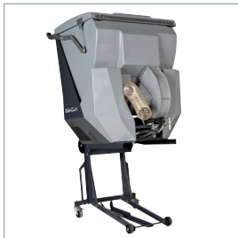
■ Grass collector