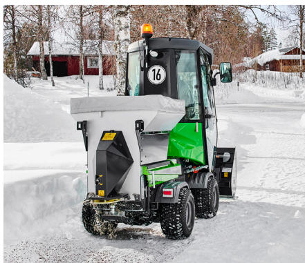
Salt and sand spreader