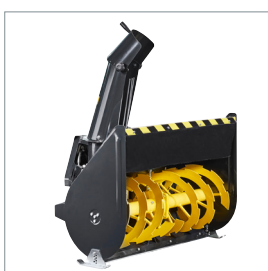
□ Snow blower