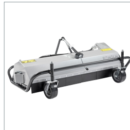
■ Flail mower