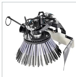
■ Weed brush