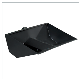
■ Tipping shovel