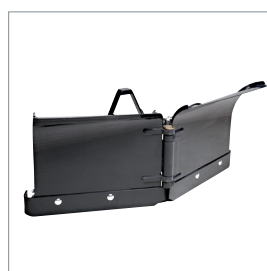
□ Snow V-plough