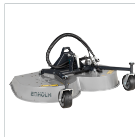
■ Rotary/mulch mower 1200