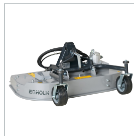
■ Rotary, mulch or collection mower 1000