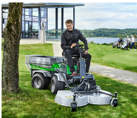
Rotary/mulch mower 1200