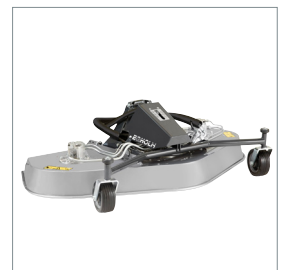
■ Rotary/mulch mower 1500