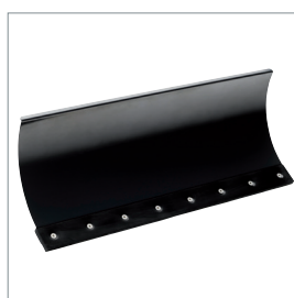
□ Snow plough