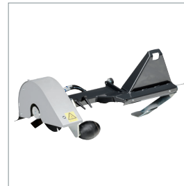
■ Lawn edger