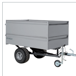
■ Tipper trailer