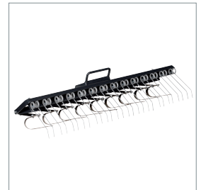
■ Environmental rake