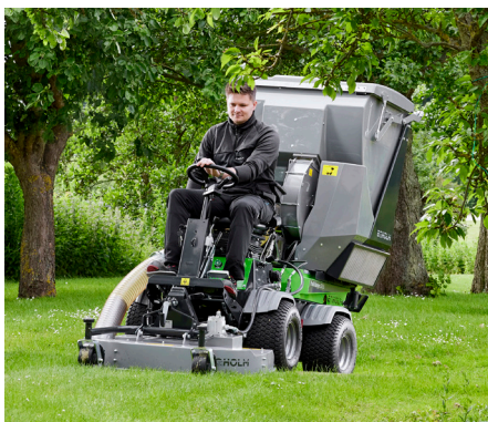
Rotary/mulch mower 1000 with grass collector