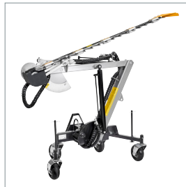
■ Hedge cutter