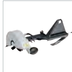
■ Lawn edger