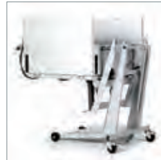
■ Load carrier with tip