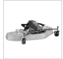
■ Rotary/mulch mower 1500