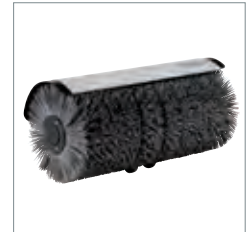
□ Snow sweeper