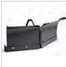
□ Snow V-plough