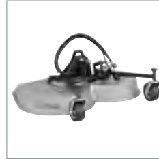
■ Rotary/mulch mower 1200