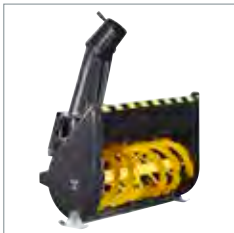
□ Snow blower