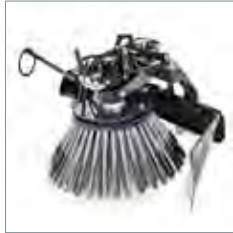
■ Weed brush