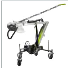
■ Hedge cutter