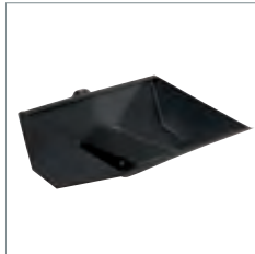
■ Tipping shovel