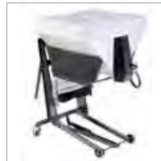
□ Salt and sand spreader