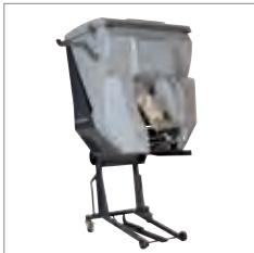
■ Grass collector