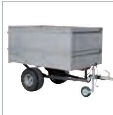
■ Tipper trailer