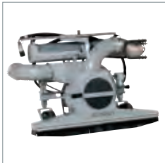
■ Leaf suction unit