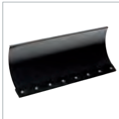
□ Snow plough