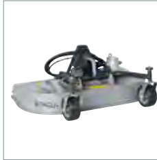
■ Rotary mulch or collection mower 1000