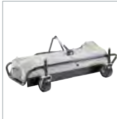
■ Flail mower