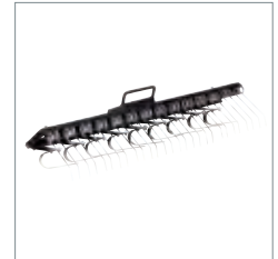
■ Environmental rake